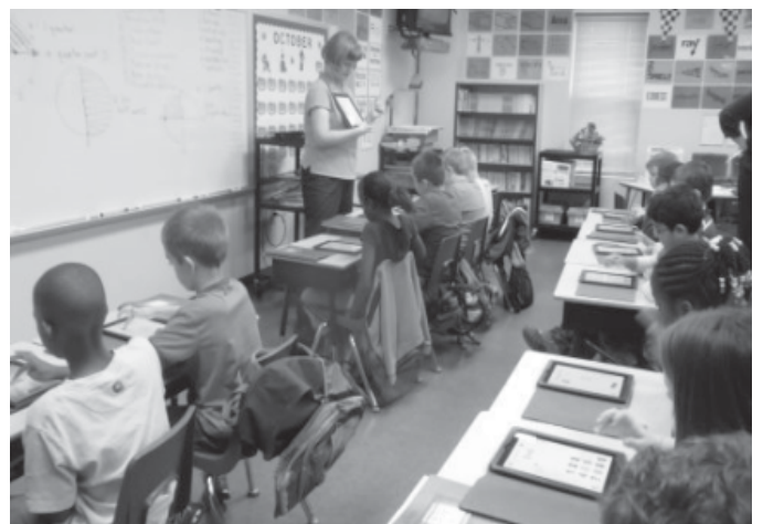
Students using iPads purchased with last year's funds.